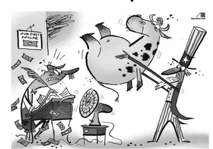
BOB STAAKE FOR THE WASHINGTON POST

The More Oratory Reveals Only Nothingness bill to encourage